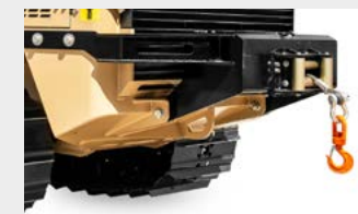
Rear winch with 6 t pulling power