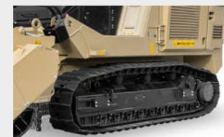
Tracked chain guides