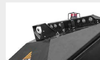
360° I/R view cameras system